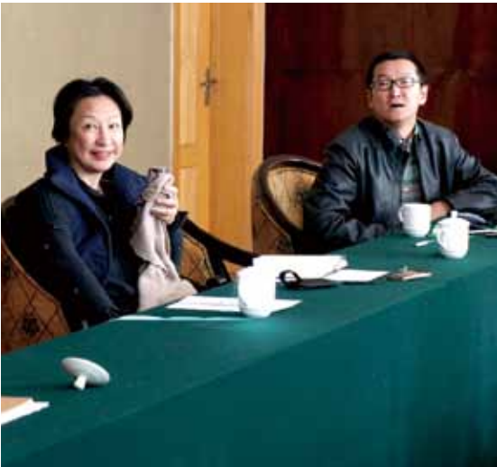
The secretariat share and study the research achievements of “Government–Social Organization Relationship”