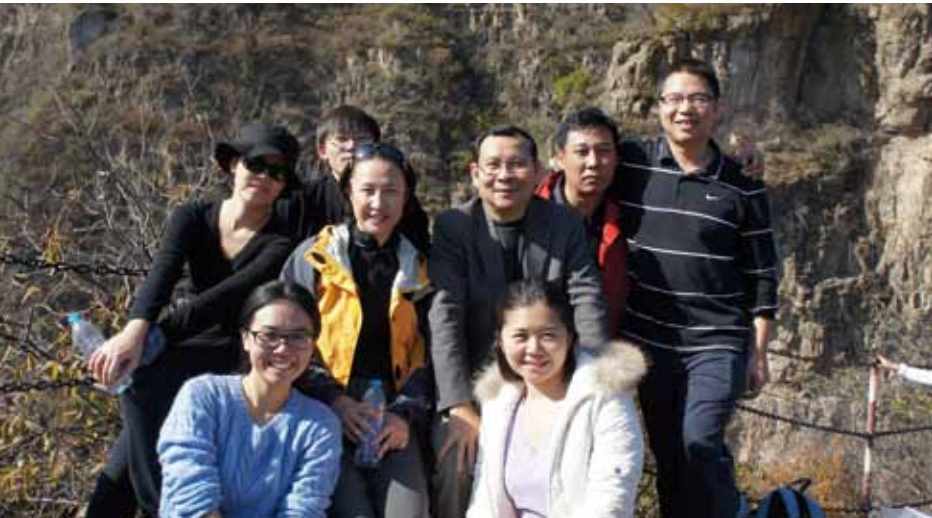
Group photo at the Longqingxia Valley team building activity