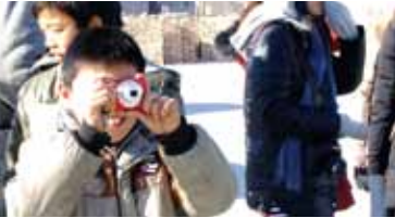
A children's photography class was started by community organizations