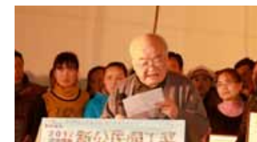
Professor Qian Liqun spoke at the awards ceremony

» Program achievements The Working Condition Survey of Teachers in Schools of Migrant Children had 280 teachers participating from 163 schools in 9 cities. In 2012, the educational wishes of 421 teachers from 12 cities were funded to realize their dreams, with a total fund of RMB 328,445.30.