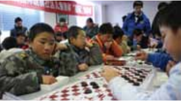
On December 31, 2012, the first session of community children "Star" international checkers tournament was successfully held.

》 Resource introduction: to provide 1200 books donated by the Xiping Foundation and an art education fund of RMB 5,000-10,000 donated by the IDO Foundation for each cooperative organization.