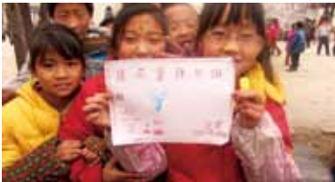
"I love action" Children Independent Program – environmental protection in action