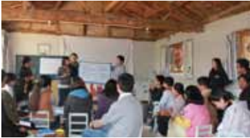
April: Beijing workshop with the theme of introducing the city exploration courses of the Growing Home