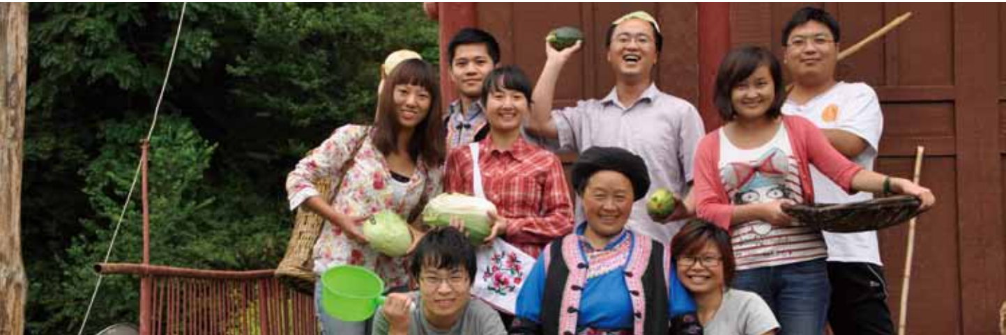
Post-disaster social loss assessment and intervention action research. College teachers and students on a rural eco-experience tour

» Study on social loss of ecological immigration Explore social impact and social losses of immigration with ecological immigration as its starting point. The program provided funds for teams to conduct research in 12 settlements in places such as Inner Mongolia, Ningxia and Yushu in Qinghai Province, and formed a preliminary indicator evaluation system and intervening methods of social loss.