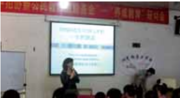
Sunshine guide workshop – a lecture on interpersonal relations with the theme of "friends for life".