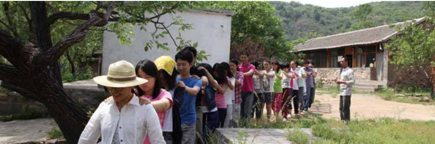
An employee from the Nature School (first from the left) leading the media to have a barefoot experience of nature.