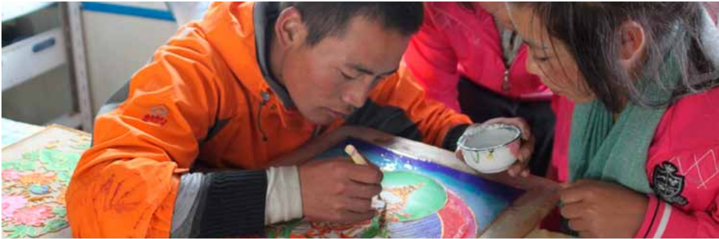
Post-disaster reconstruction community development program of Yushu, Qinghai Province. Students learn how to make traditional Tibetan Thangka art in the Limin School.

» Summary and promotion of new rural work experience The program encouraged the Green Cross to share its success and failures based on its experience in providing a reference for rural community work in disaster areas. The experience summarizing training session was held in October at Xinyang Normal University by the Beijing Green Cross. The Collection of Summary and Promotion of New Rural Work Experience was compiled based on training content.