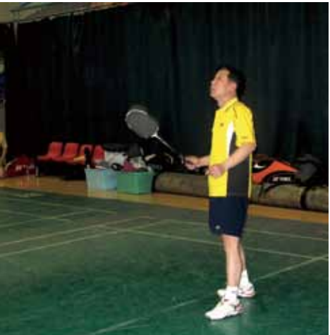
Playing badminton every week for fitness