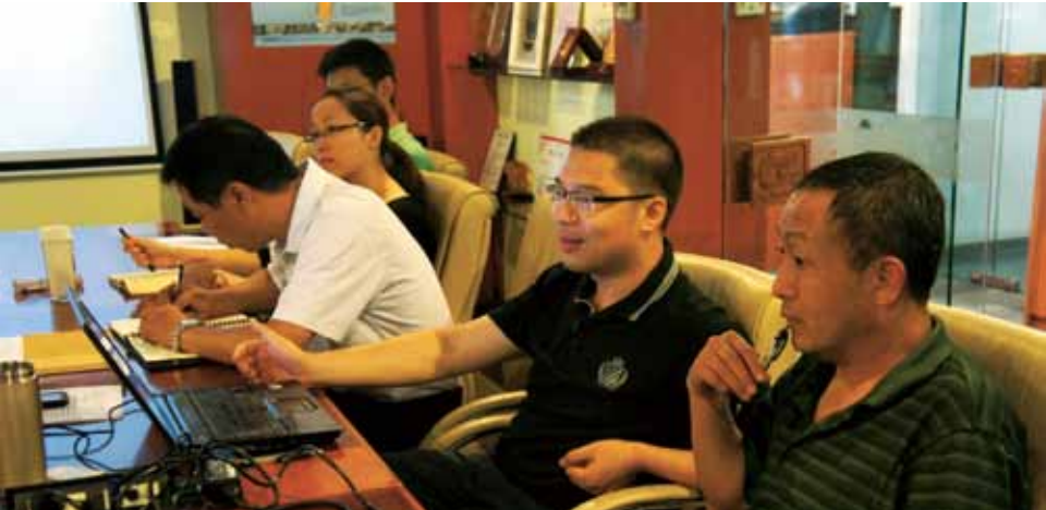
Team building meeting