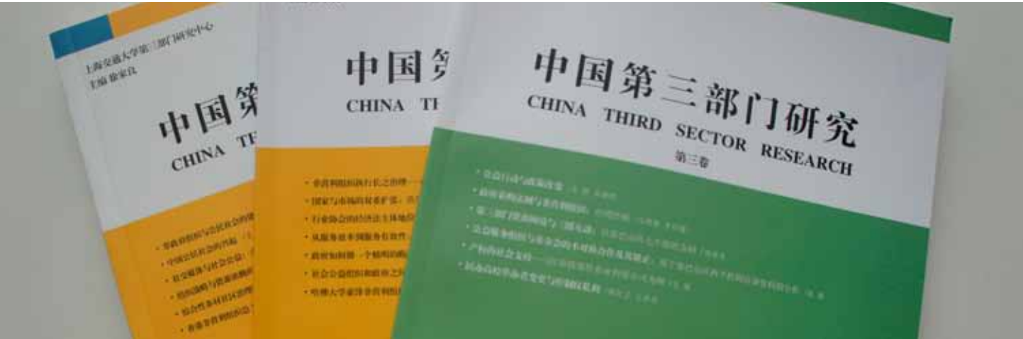
Series of Research on China's Third Sector

In 2012, the research programs funded three projects, approving RMB 750,700 and concluded the program of Development of Philanthropic Start-up Cases conducted by NPI (Shanghai), the program of SROI Pilot Assessment conducted by Social Resources Institute and a handful of other programs.