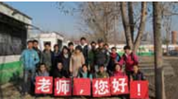
On November 17, the public advocacy activity of walking 14 kilometers to 7 migrant children schools and sending their greetings to teachers.