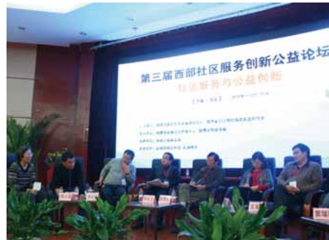
the 3rd Innovation Forum of Western Community Service