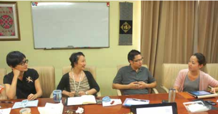
Program officer is introducing the progress of the work