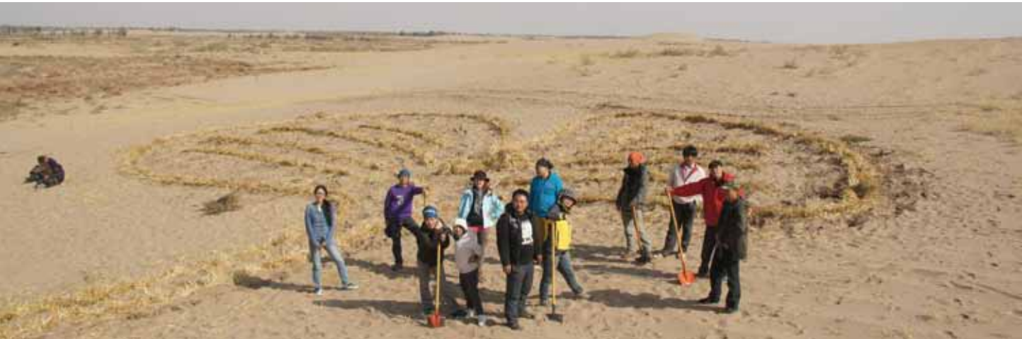
Minqin trip of Ginkgo fellows. Pictured in front of the "Ginkgo Fellow Forest"