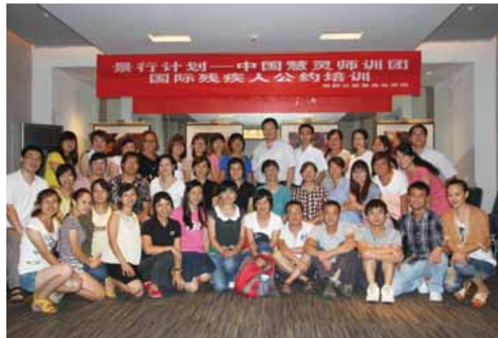
China Huiling, the training of International convention of persons with disabilities

From 2013 to 2014, the Bright Way Program will still be in its pilot stage. During this period, 3 to 5 organizations will be funded each year. Fellows will be chosen by recommendation in stage.