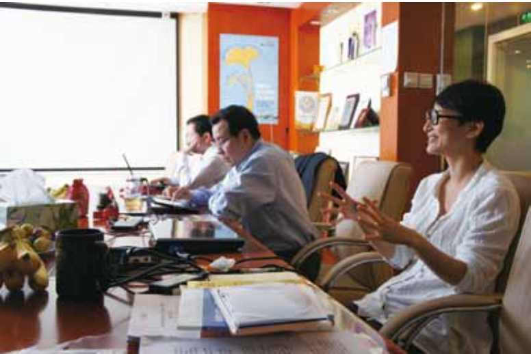
Sharing thoughts on philanthropy