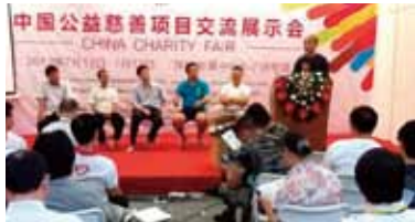
In the special promotion, Ginkgo fellows went on stage barefoot to express the concept of being "down to earth".