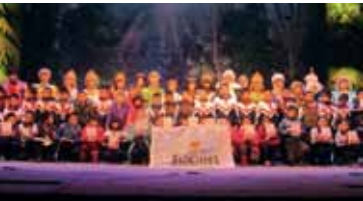
Art Journey– Arranging for 1,500 migrant children to watch children's drama