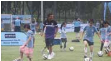
On July 25, 70 students participated in football summer camp with Manchester City football club