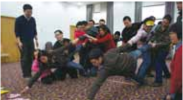
On March 1, Ginkgo fellows undertook team-building games.

» Resource pairing The follow-up support of the Ginkgo Program provides Ginkgo fellows with specific resource pairing and media promotion. In 2012, the program provided four major categories of 36 resource pairing services for Ginkgo fellows, including a learning exchange, philanthropic publicity, entry to campaigns through recommendation and in-kind donations. For example, it recommended Ginkgo fellows to participate in the APEC Young Entrepreneurs Summit and provided advertisement positions in public media like Douban FM and ECO-NOMY, in order to introduce them to the public.