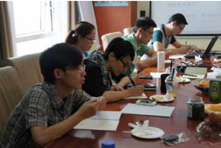
At the team building meeting, all the staff from the secretariat communicate with each other and study together