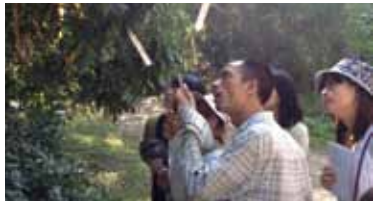
On September 16, Ginkgo fellows looked at protected tree species in the Taiwan Taomi wetland.