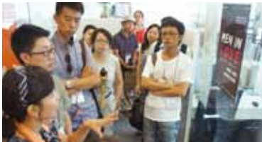
On August 6, Ginkgo fellows and representatives of the top 50 from the "Cinnovate Initiative" program communicated with the Korean Pull-together Foundation.