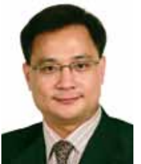
Zhu Weiguo Supervisor, Chief of Policy and Regulation Department of Legislative Affairs Office of the State Council