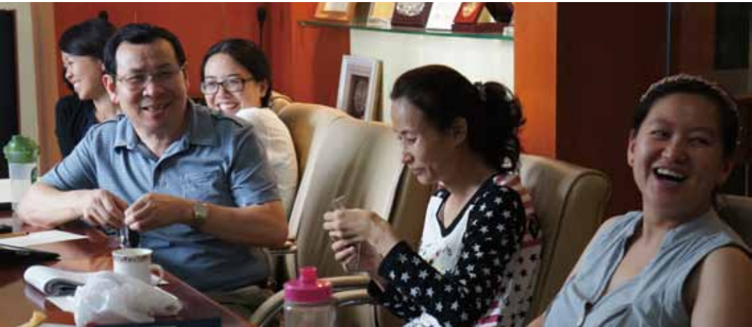
The secretariat team building meeting full of joy