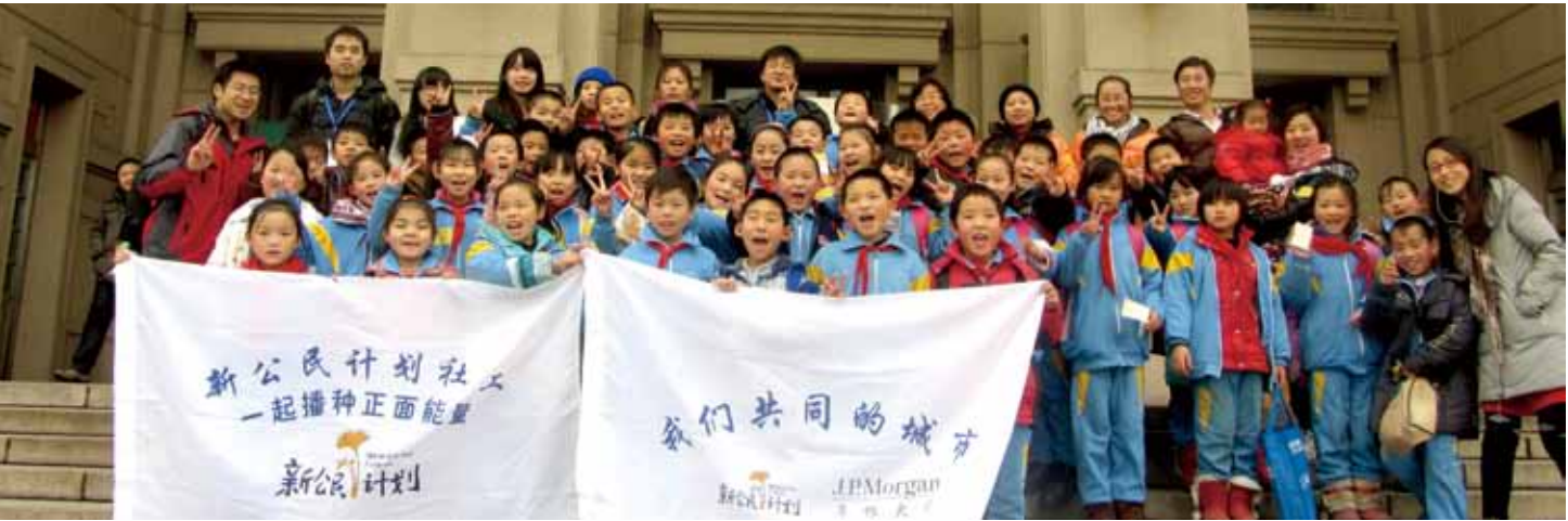
Our public city program – children visit the Museum of Natural History