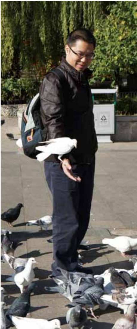
Longqingxia Valley team–building activity of the secretariat