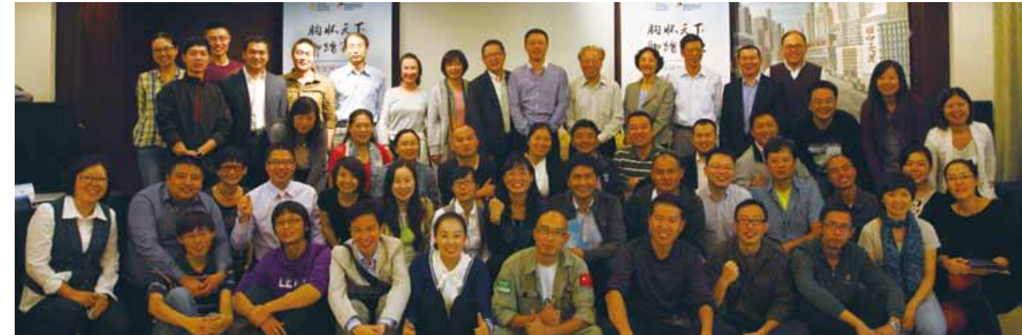
On October 10, the candidates took a group photo with Ginkgo fellows, expert judges and Narada Foundation staff after the candidates' meet-and-greet.